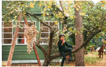
Plant One Tree in My Yard