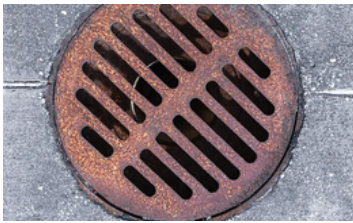
I ♥ Storm Drains