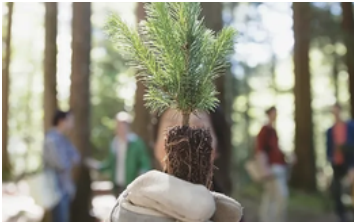
Volunteer For Trees

Click on one of our Impact Projects below to get the template. Write up your project, find your stakeholders, follow the procedure, and do the math!