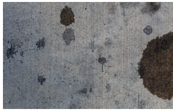
Don't Drip and Drive