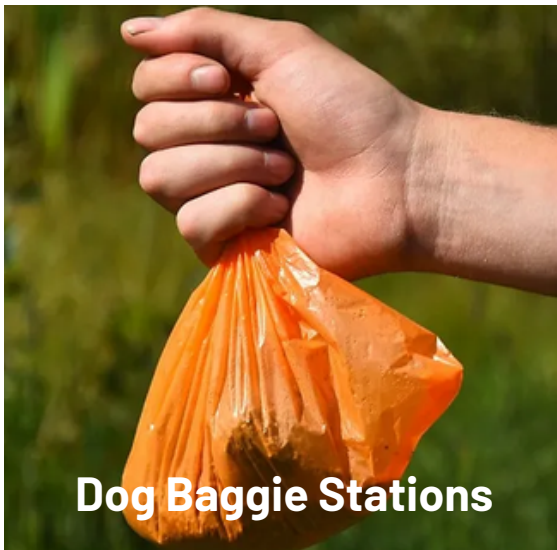
Dog Baggie Stations