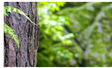
Oldest Tree in My Neighborhood