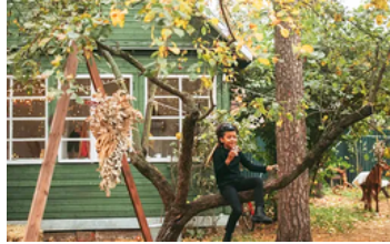
Plant One Tree in My Yard