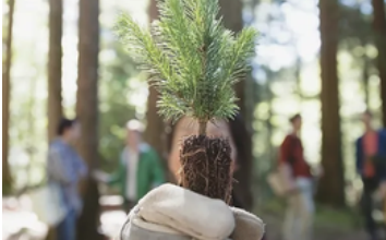
Volunteer For Trees

Click on one of our Impact Projects below to get the template. Write up your project, find your stakeholders, follow the procedure, and do the math!