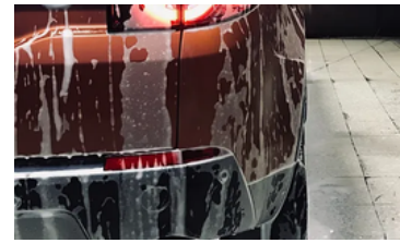
Use a Commercial Carwash